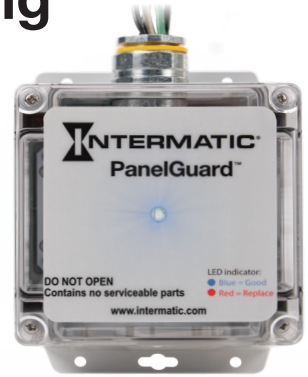
PANELGUARD L5 Series Surge Protective Device

PANELGUARD® Surge Protective Devices by Intermatic protect against harmful transients that can damage electrical devices when generators turn on after a power loss. The SPDs can be placed at the main entrance panel, sub-panels, and at the automatic transfer switch for a multi-tiered defense at startup and power down.