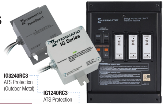
IG3240RC3 ATS Protection (Outdoor Metal)